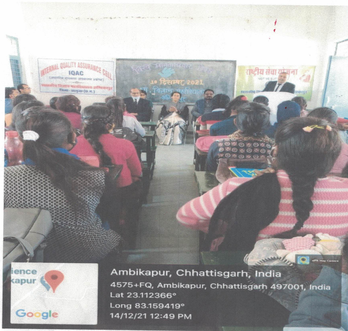
Human right day